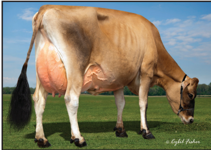
DUTCH HOLLOW TOPEKA CHARLIZE Sister to the Grandam of Lot 8