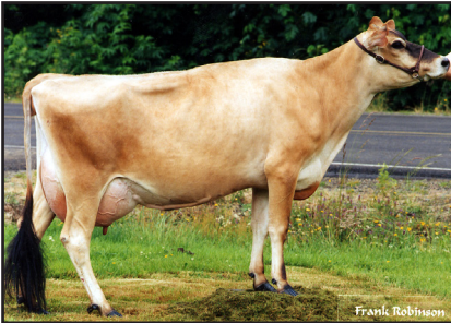
WOODSTOCK BERRETTA LESLIE, E-90% Eighth Dam of Lot 10