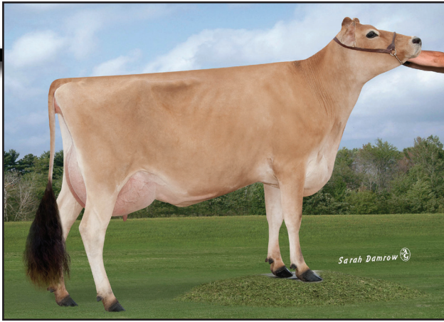
TLJ HENDRIX HILIFE, E-90% Sister to the Grandam of Lot 7