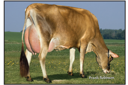
Pearlmont Jimmie Dawn-ET, E-90% 1-11 305 17,226 4.0% 686 3.7% 644 Sold in the 2010 Sale