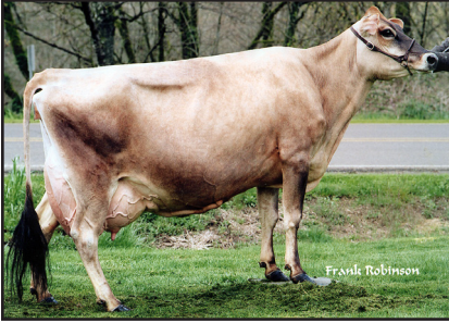
WOODSTOCK ALF LESLIE, VG-87% Seventh Dam of Lot 10

JX CO-OP AD WORLD CUP {4}-ET JE840003126073776 GT99K BBR 100 JH1F 1JE935 CDCB GPTA S 04/01/2020 1105DAUS 109HRDS 66%RIP 99%R -219M 0.16% 23F 77%ILE 99%R 0.15% 23P 379CM$ 331NM$ 226FM$ 326GM$ 3.3PL 2.3LIV 1.5DPR 1.8CCR 3.0HCR 2.97SCS 0.2MFV 0.6DAB 0.2KET -1.1MAS 0.1MET 0.0RPL 3.09HTI AJCA 04/01/2020 289DAUS GPTAT 96%R 0.4 GJUI 6.3 GJPI 93%R 94