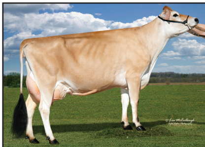
Hei-Bri Galvanize Calli, VG-87% 3-8 278 3x 24,120 4.7% 1,138 3.9% 929 Sold in the 2013 Sale