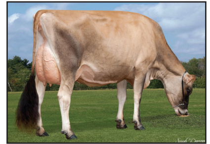
Clareshoe Allstar Zoom Zoom, E-91% 2-10 305 18,750 5.9% 1,111 3.9% 739 Sold in the 2014 Sale