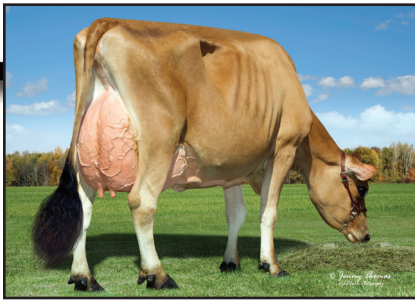
DUTCH HOLLOW IMPISH CHINCHILLA-P-ET Dam of Lot 8