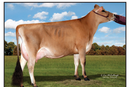
Heartland Topeka Madalyn-ET, VG-87% 3-4 290 3x 19,770 4.6% 902 4.0% 783 Sold in the 2014 Sale