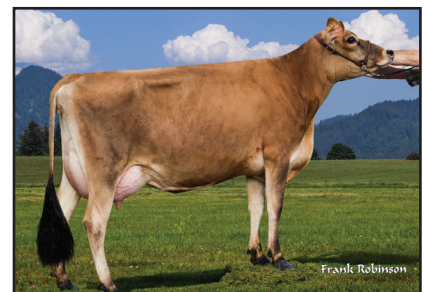
Pine Hill Zipper Luminata, VG-82% 2-10 297 15,550 4.8% 746 3.8% 587 Sold in the 2015 Sale