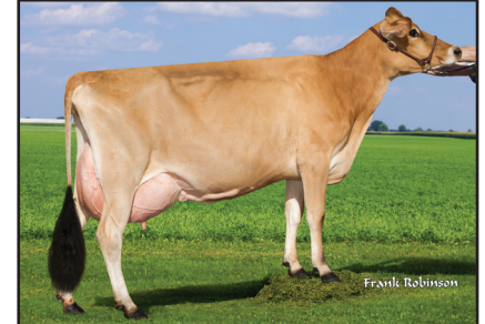
JX DUPAT HARRIS 17713 {5}-ET Grandam of Lot 15

DUPAT LEXICON 9172 80% 1-09 305 2 18880 4.8 900 3.6 673 104DCR 2326C