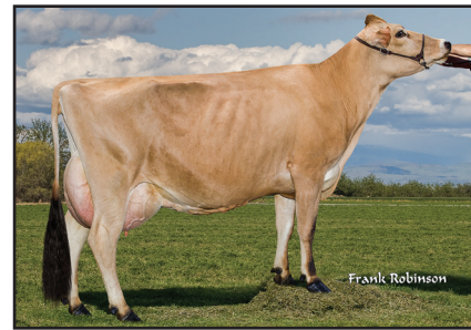
BW Renegade Charia X37, E-90% 4-2 278 17,980 5.0% 903 3.6% 656 Sold in the 2013 Sale