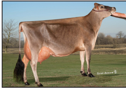
Hilmar Celebrity 26191, E-93% 3-11 305 25,770 5.3% 1,374 3.8% 972 Sold in the 2011 Sale