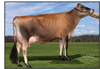
Heartland Pharoah Lindsey, VG-88% 3-4 305 21,700 5.0% 1,079 3.7% 806 Sold in the 2015 Sale