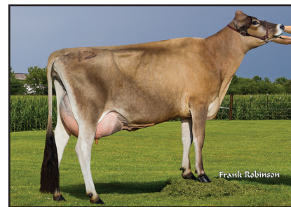
Hillview Machete Key-Charm-P-ET, VG-85% 1-11 305 3x 25,420 3.5% 882 3.0% 760 Sold in the 2015 Sale