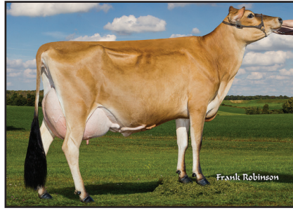
Hi-Land Daybreak Dotty, VG-86% 5-4 305 23,110 5.1% 1,175 3.8% 870 Sold in the 2014 Sale