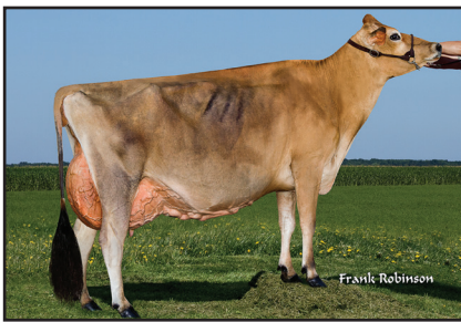
Free-Mar Blackstone Beeves, E-92% 4-2 305 3x 25,150 5.2% 1,307 3.5% 890 Sold in the 2009 Sale