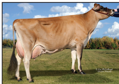
Summetz Mecca Savannah Shanntell-ET, VG-88% 3-9 305 27,150 4.8% 1,297 3.6% 965 Sold in the 2009 Sale