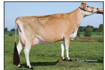
Jars of Clay Plus Vanessa {6}, E-90% 1-10 305 14,960 4.8% 725 3.7% 549 Sold in the 2012 Sale