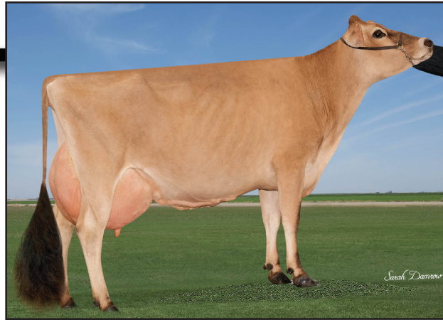
FOUR J GAMEDAY 19536 {5}, VG-84% Grandam of Lot 2