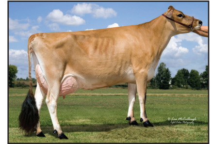
HEARTLAND ABE AVALANCHE Fourth Dam of Lot 11

SCHULTZ LEGAL CRITIC-P USA 117217618 GT50K BBR 100 JH1C 11JE1098 CDCB GPTA S 04/01/2020 4078DAUS 371HRDS 3%RIP 99%R 33M 0.05% 13F 41%ILE 99%R 0.03% 7P 208CM$ 196NM$ 172FM$ 149GM$ 3.3PL 0.6LIV -0.6DPR -0.6CCR -1.5HCR 2.91SCS -0.2MFV 0.2DAB 0.8KET 0.4MAS 0.3MET 0.0RPL 0.71HTI AJCA 04/01/2020 2564DAUS GPTAT 99%R 0.8 GJUI 9.2 GJPI 99%R 57