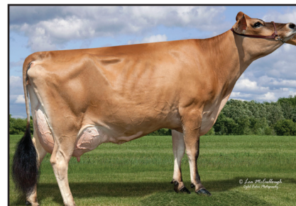
TJF/Lee Action Mamme 847-ET, E-92% 3-1 305 3x 19,550 5.4% 1,053 3.7% 721 Sold in the 2009 Sale