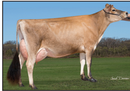
Forest Glen Clearvision Jadey, VG-83% 1-9 305 17,400 4.9% 853 4.0% 691 Sold in the 2016 Sale