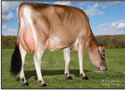
DUTCH HOLLOW SANTANA CHIQUITA-P-ET Grandam of Lot 8