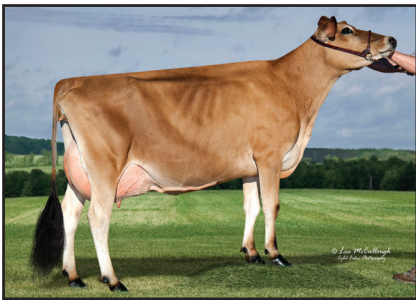
Marv Du Blackstone Easter {6}-ET, VG-87% 2-2 305 16,360 5.5% 906 4.0% 662 Sold in the 2010 Sale