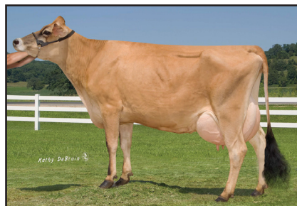
Boyd-Lee Matinee Habanero-ET, E-91% 5-10 305 3x 24,080 5.3% 1,272 3.5% 849 Sold in the 2008 Sale