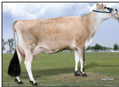
JX SR Goose Reaction {3}-P, E-94% 3-10 299 3x 23,450 4.9% 1,146 3.7% 866 Sold in the 2012 Sale