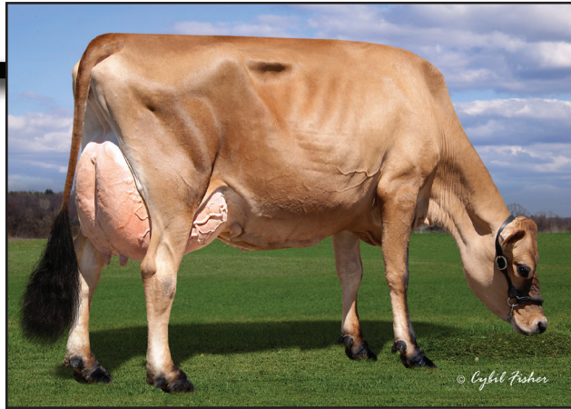
HILLVIEW LOUIE KATI-KI-P, E-90% Great-Grandam of Lot 14