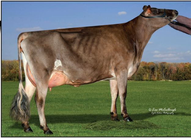
HEARTLAND SANTIAGO AINSLEY-ET, E-92% Great-Grandam of Lot 11