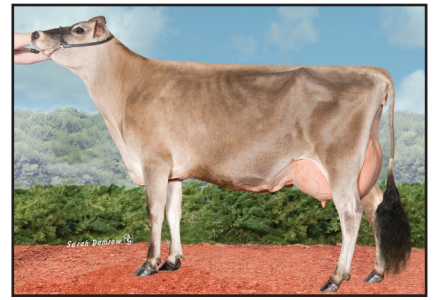
Family Hill Moment Fawn, E-90% 2-11 305 17,430 6.1% 1,055 3.9% 673 Sold in the 2010 Sale