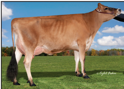
DUTCH HOLLOW MACK CHERYL 6015-ET Sister to the Grandam of Lot 8