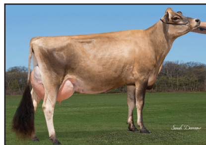
JX Crescent Premium Gudlady{5}-ET, VG-82% 1-8 305 17,740 5.6% 985 3.8% 669 Sold in the 2016 Sale