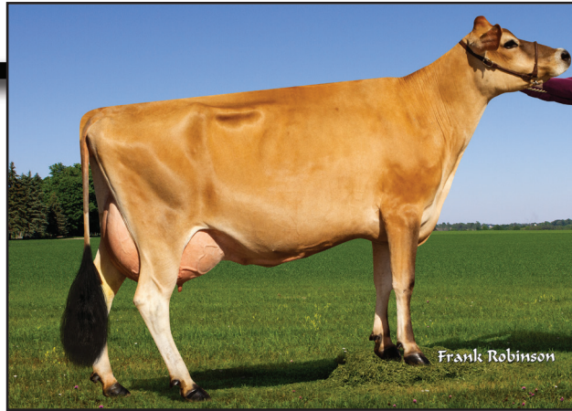
AHLEM LANCER LETTY 49991, VG-83% Dam of Lot 12