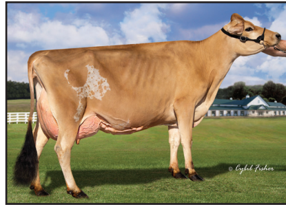
DP Prescott Gwen 1619, VG-88% 4-2 305 23,670 5.7% 1,342 3.6% 850 Sold in the 2013 Sale