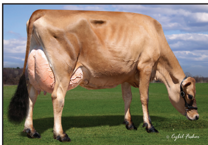
Hillview Louie Katiki-P, E-90% 3-2 305 3x 26,950 4.5% 1,024 3.0% 817 Sold in the 2013 Sale