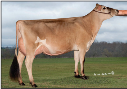
All Lynns Irwin Trista-ET, E-91% 4-9 305 19,400 4.4% 857 3.5% 687 Sold in the 2013 Sale

The production is bred into every heifer selected for the National Heifer Sale. Buyers of previous consignments have realized the benefits of this potential.