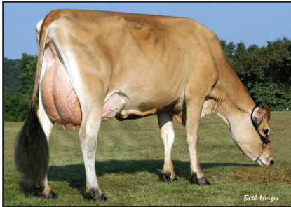
DUTCH HOLLOW VALENTINO CHERYL-ET Great-Grandam of Lot 8