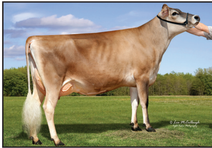
MS Irwin 7762 X899, VG-88% 3-10 305 23,710 4.5% 1,058 3.7% 883 Sold in the 2014 Sale

These well-known animals have contributed to the Jersey breed as we know it today. Many sons, grandsons, and female descendants have made their mark on the A.I. industry and as mothers of sons around the country.